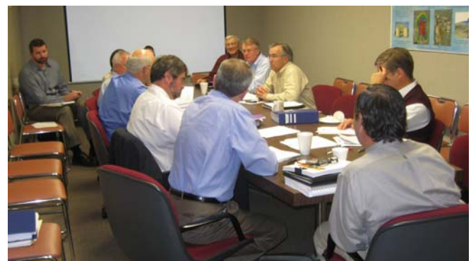
Air Quality Committee Meeting at LACSD on 5-26-10